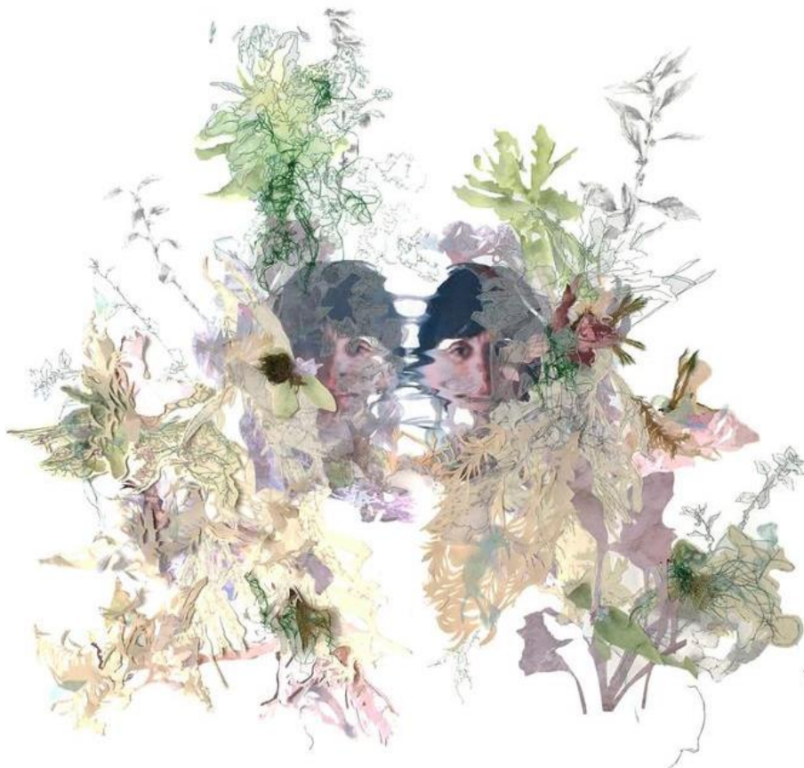
Ida Mitrani, Echoed Duality' , 54x77cm, mixed media drawing, paper cutouts, collage, digital media, synthetic mesh combined with organic life forms.

GIS e.i.r.e. Études Irlandaises • Réseaux et Ergues